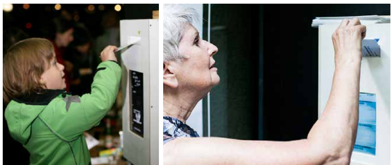
Example: Hybrid Letter Box Design Research Lab | Berlin University of the Arts