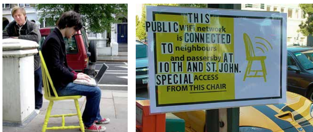
Example: Yellow Chair Stories Superflux