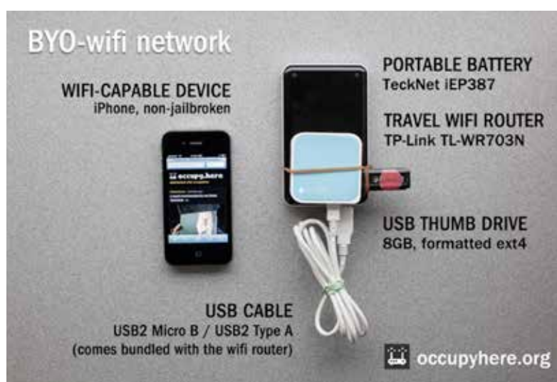
Example: Occupy Here occupyhere.org

HYBRID PUBLIC SPACES AS TRIANGULATORS ENABLING STRANGERS TO INTERACT WITH EACH OTHER