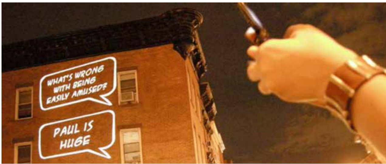
Example: TXTual Healing Paul Notzold

HYBRID PUBLIC SPACES AS TRIANGULATORS ENABLING STRANGERS TO INTERACT WITH EACH OTHER