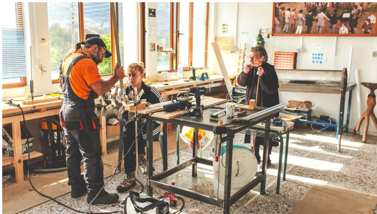
Figure 3. A moment at the Tzoumakers.gr makerspace depicting the friendly relationship between local experts and community members toward building common experiences and exchanging knowledge.

YouTube video inspires and teaches a distant community in various p2p ways to build actual tools, improving their everyday life.